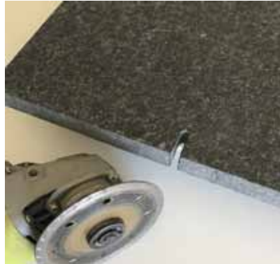
Central edge Keyway: Easily cut with 4 inch grinder.