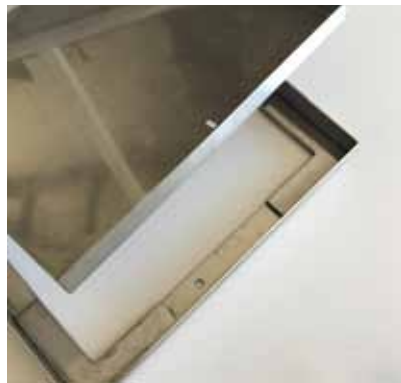
316 stainless steel QUAD Edge Protector also supports lid, provides ventilation and allows key rotation.