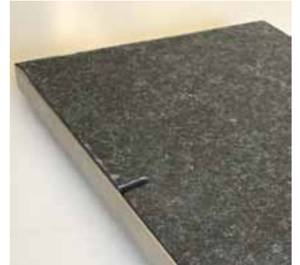
Inlay is laminated flush into the QUAD 316 stainless steel tray.